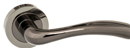
Product Finish Pictured: Black Nickel